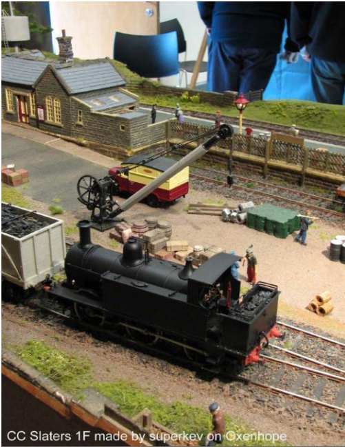
CC Slaters 1F made by superkev on Oxenhope

Oxenhope is a layout which represents the terminus station of the now preserved Keighley & Worth Valley Railway. It was featured in the April 2010 issue of Hornby Magazine .